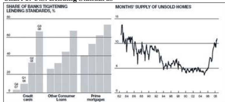
Chart 1: U.S. Lending Standards

A few days later I ran into an article in the Daily Telegraph which illustrates the magnitude of the problem (see chart 1 below). Although this chart is based on U.S. data, the behaviour of banks around the world is broadly similar. It is clear that tightening lending standards are no longer a phenomenon exclusively linked to property loans. Consumer loans in general, and credit card loans in particular, are now subject to much closer scrutiny.