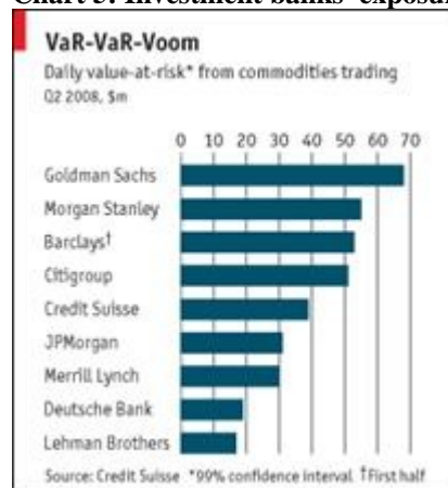
Chart 5: Investment banks' exposure to commodities

The first shoe that dropped came off the credit leg. Then the property shoe dropped to the ground rather ungracefully and, in recent months, the equity shoe has fallen off as well. Only the commodity shoe is still attached to the four legged beast and only just. What I find most interesting, though, is that the most vocal supporters of the notion that the bull market in commodities is driven by fundamental factors are the same investment banks which stand to lose the most, should commodity markets collapse (see chart). Case closed.