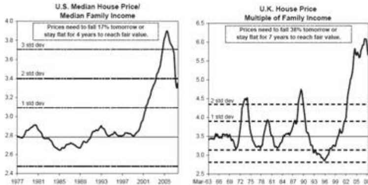
Chart 2: Current overvaluation of U.S. and U.K. homes

When U.S. home prices began to skid, the damage inflicted was swift and devastating. We know now that that the quality of many loans was poor, causing large write-offs across the industry. With house prices in the US and the UK still well above their long-term averages relative to disposable income (see chart 2 below), there is no reason to believe that they will not continue to fall for quite some time yet. The write-offs will spread from sub-prime to prime and to many other countries as well, a process which has, in fact, already begun. Two criteria must be met before property will start to appreciate in value again - house prices must reach (or fall below) their long term equilibrium values and the current overhang (see chart 1) must be dramatically reduced. All this will take time - years rather than months.